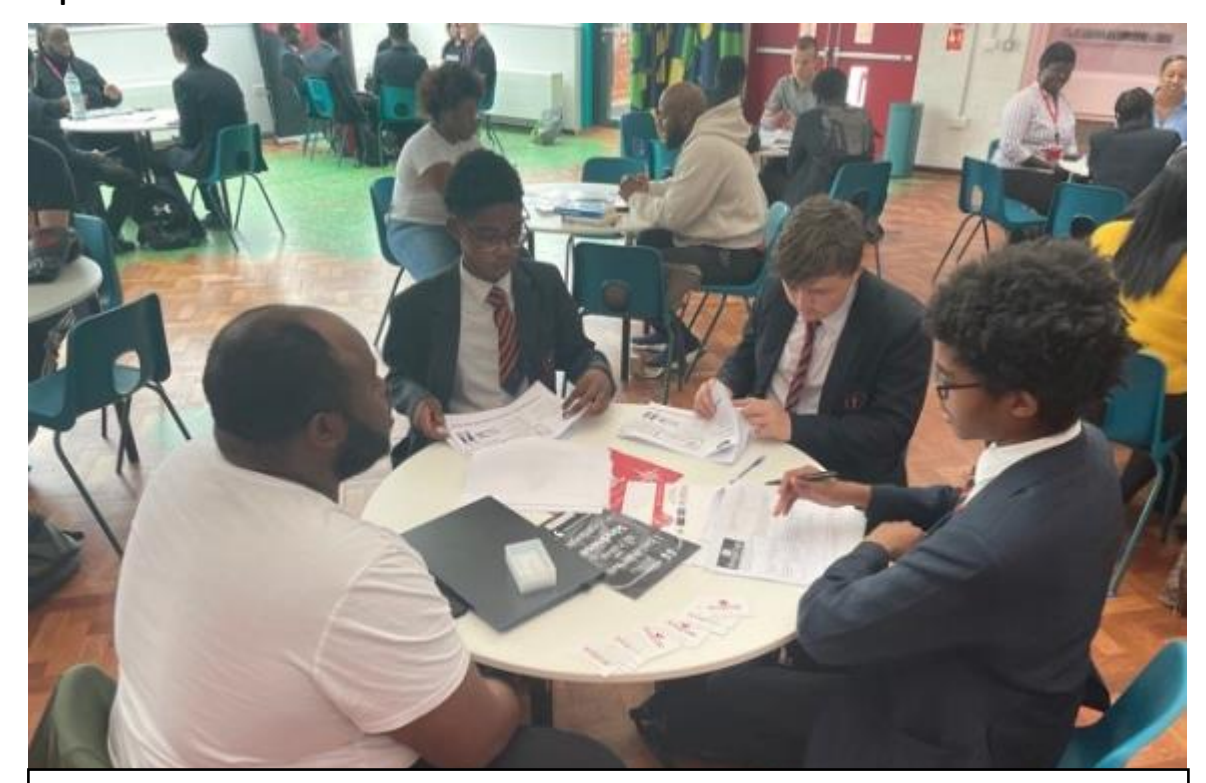
Students complete the Career Ready task speaking with the companies every 12 minutes.

Students praised the event for its usefulness in helping them understand vocational pathways and the subjects required to enter their desired professions. As a result, many students have secured work experience opportunities in their chosen fields for the near future. Congratulations to the Year 10 students who were commended by the participating companies for being outstanding representatives of the school.